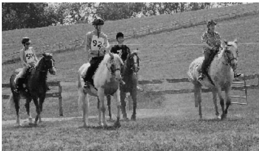
The Miracles in Motion Drill Team.